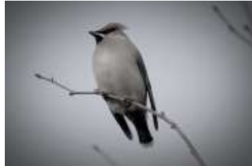
Waxwing

A waxwing year is when the cold Scandinavian winter drives the waxwings in desperation across the North Sea to us. It doesn't happen every year and when it does the birds are more often seen on the east coast of Britain..However, they can be driven down to the Severn Valley in hard times.