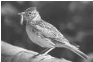
Skylark

If you head out to Elberton, along the bridleway from Olveston, the skylark can be heard and seen in and above the corn fields. It is unmistakable and identified by its song in flight and position in the sky. When seen descending