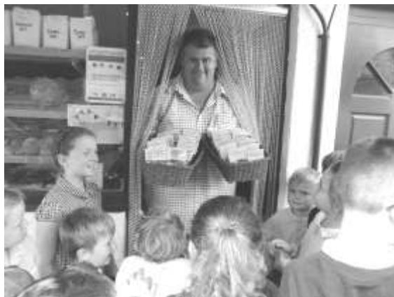
The Bakery visit