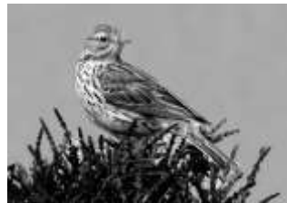
Meadow Pipit

A bird which can confuse is the meadow pipit which also likes to sing its way up into the heavens but its song is a little plainer and less musical. Apart from the song, the meadow pipit descends differently, dropping with its wings raised, making more a parachute descent. Also, the meadow pipit is more often seen in open country, for example along the banks of the Severn where the terrain is wilder. It is often flushed out with a flash of white on the borders of its tail and an announcement that it is a 'pipit'. It has no crest.